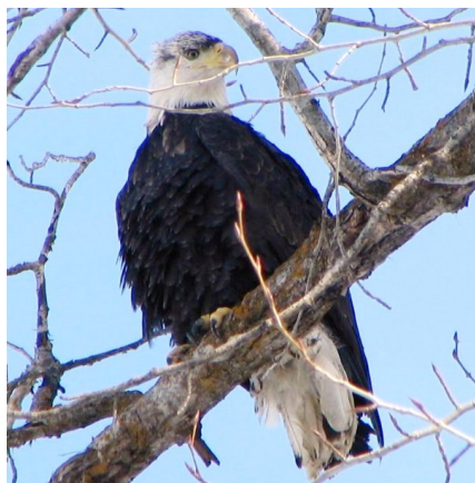
Above: The eagle back in his tree, next to the creek.